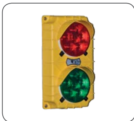
STOP & GO LIGHTS